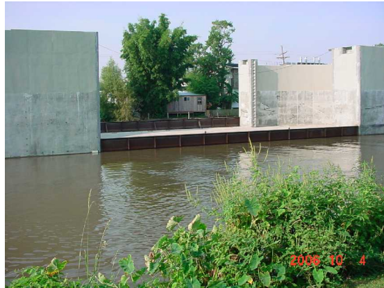
Barge Structure weight is 2,952 tons Measurements are 136'W x 55D x 30' 6"H Opening for marine traffic is 60 ft. wide