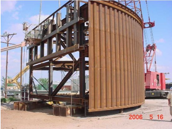
Width of each gate is 40 feet. Weight of gates is 60 tons each.

New gate is designed to operate up to a +7.0 elevation